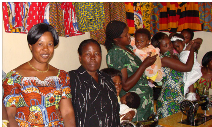
Some of the 32 graduates from the tailoring class.