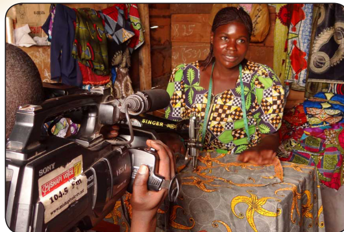
News about SowHope is spreading! Tailoring student is interviewed for the nightly TV news program in Goma, Africa.

A ccording to USAID, programs that provide women opportunities to better their health, education, and well-being have effects far beyond a single individual. A woman multiplies the impact of an investment made in her future by extending benefits to the world around her, creating a better life for her family and building a strong community. (from 50.USAID.gov)