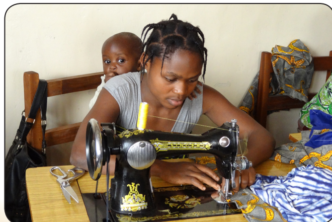
Tailoring student sewing her last project, her graduation dress!

TO INSPIRE WOMEN AROUND THE WORLD BY PROMOTING WELLNESS, EDUCATION, AND ECONOMIC OPPORTUNITIES